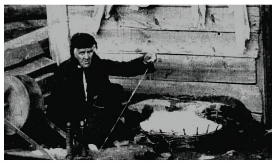
Theo Angelopoulos, Le regard d'Ulysse (1995)

Scratched images as though it was pouring down rain. The film seems wrinkled by contagion with the face of the spinners, captives of the Manákis brothers, those cameramen who ran from one end of the Balkans to the other at the dawn of the 20th century to film minuscule gestures and lives. Tentacular, they spin the wool into balls of yarn. I grope about blindly over the parchment face of a woman from a time past, in a small Greek village in 1905. The uneven depth of these images brings me to a full stop: these are the first minutes of the film by Théo Angelopoulos, Ulysses' Gaze (1995). We can hear the humming of the projector, the film unreeling and the scratching of the images. The spinners, these are the face, the sisters Nona, Decima and Morta who determine the fate of men, emerging between their agile fingers.