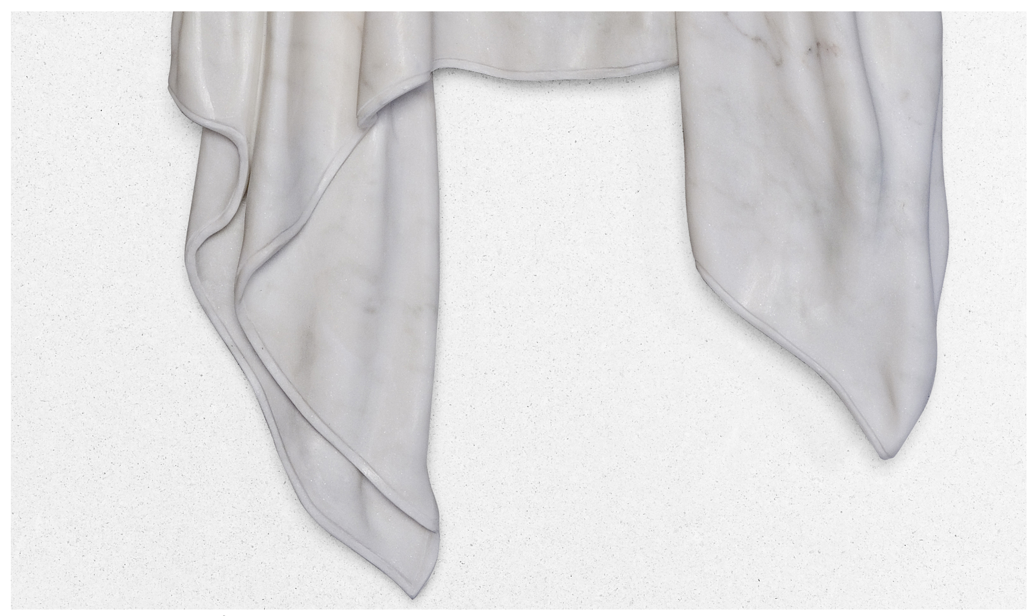
Guillaume Leblon, Weight of wet, (detail), 2015, Estremoz marble, 101 \times 51 \times 17 cm