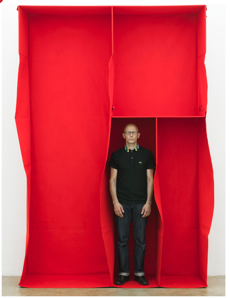
Franz Erhard Walther, Kleine rote Architektur, 1982, dyed cotton, wood, 305 \times 200 \times 40 cm