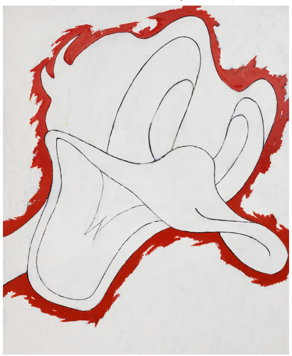
William Anastasi, Donald Duck, January 10, 1988, oilstick and paint on canvas, 227 \times 188 \times 3 cm