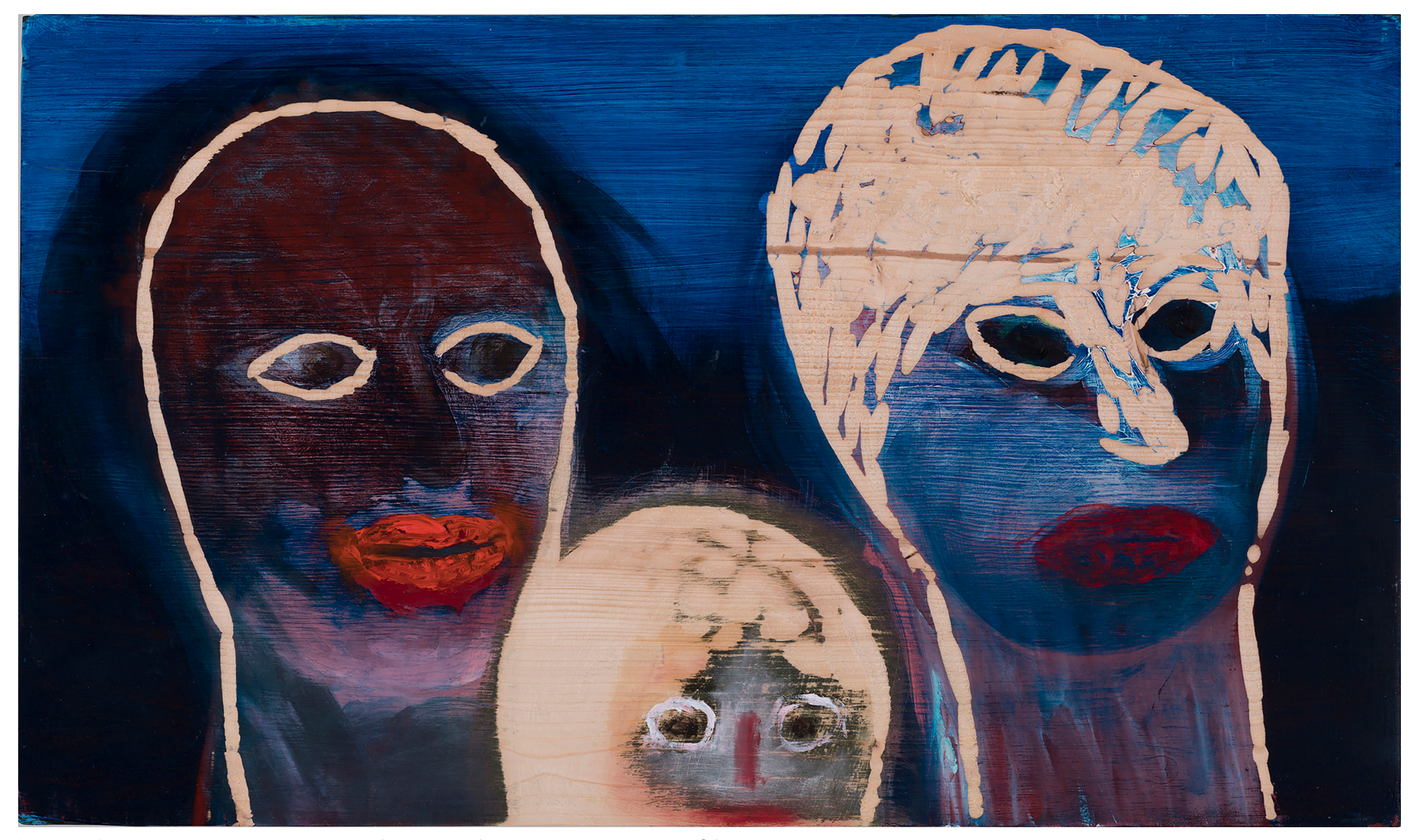
Miriam Cahn, papamamakind, 2018 + 21.4.19, oil on wood, 40 \times 68 \times 2 cm