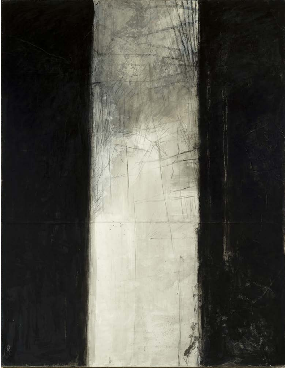
Colette Brunschwig Sans titre, ca. 1985 acrylic, ink on canvas 191 x 149 cm Unique Inv.#CB/P 11