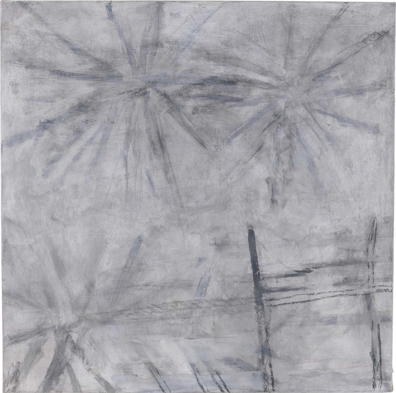
Colette Brunschwig Sans titre, 2000 acrylic on paper mounted on canvas 75 x 75 cm Inv.#CB/P 25