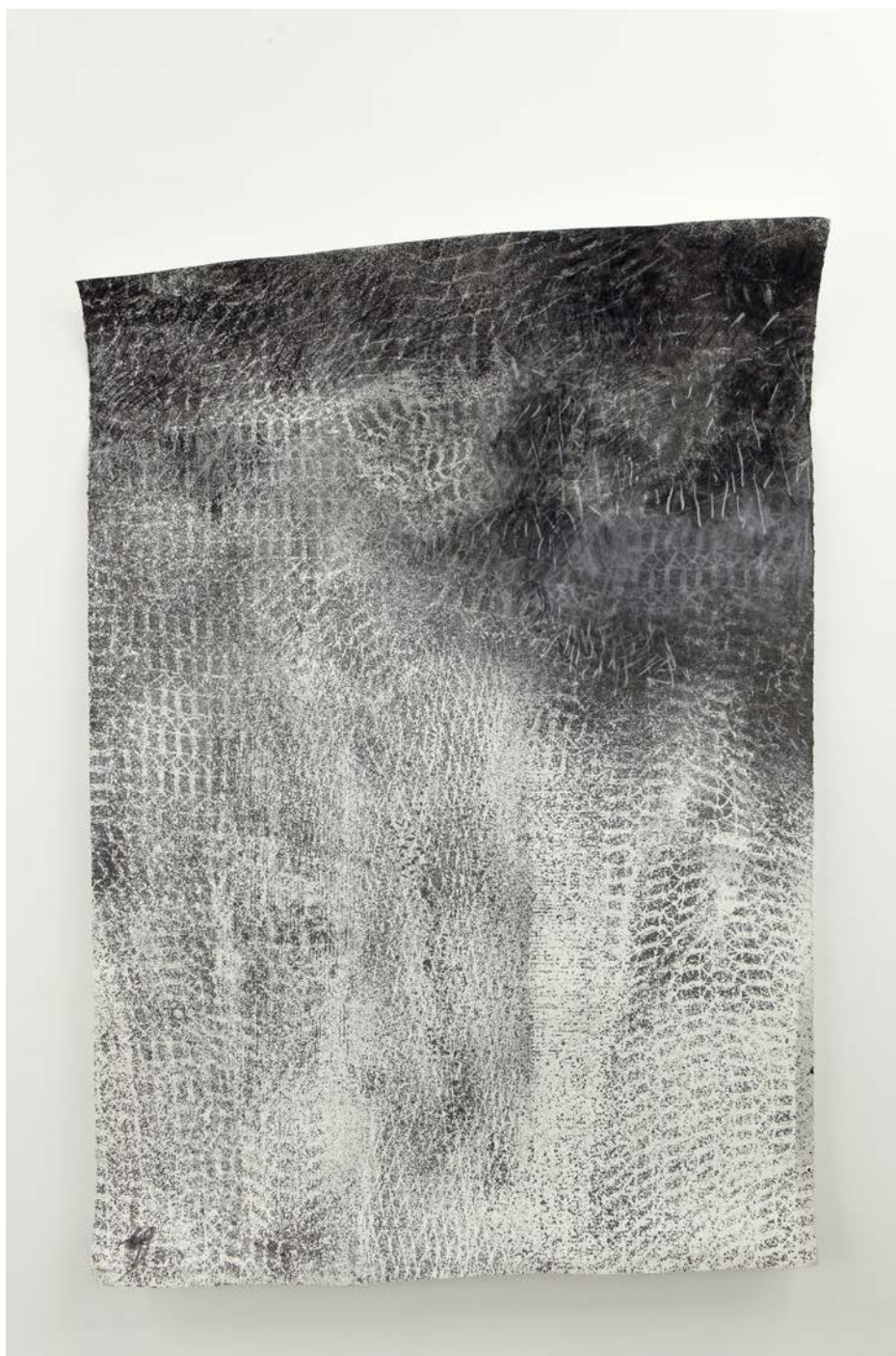
Colette Brunschwig Pochoir 1, 2010 indian ink, pencil on paper 149 x 107 cm Inv.#CB/D 1