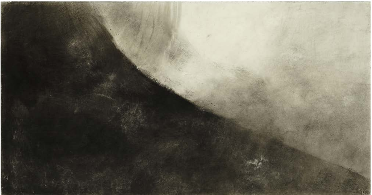
Colette Brunschwig Sans titre, 1981 indian ink on paper 75 x 143 cm Inv.#CB/D 17