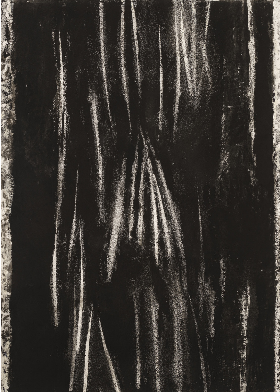
Colette Brunschwig Sans titre, 2015 India ink on paper 106 x 75 cm Inv.#CB/D 11