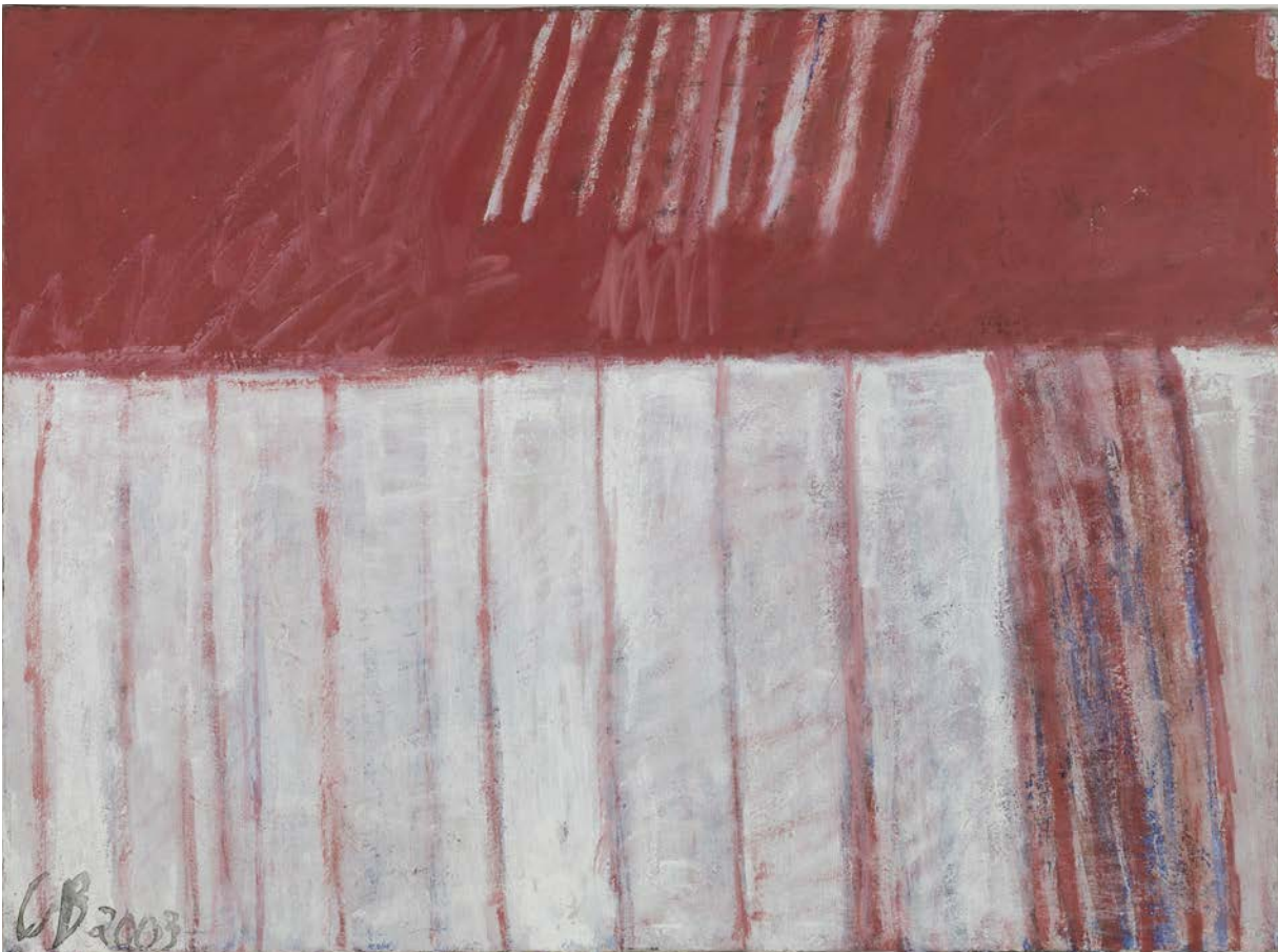
Colette Brunschwig Sans titre, 2003 acrylic on canvas 54 x 75 cm Inv.#CB/P 20