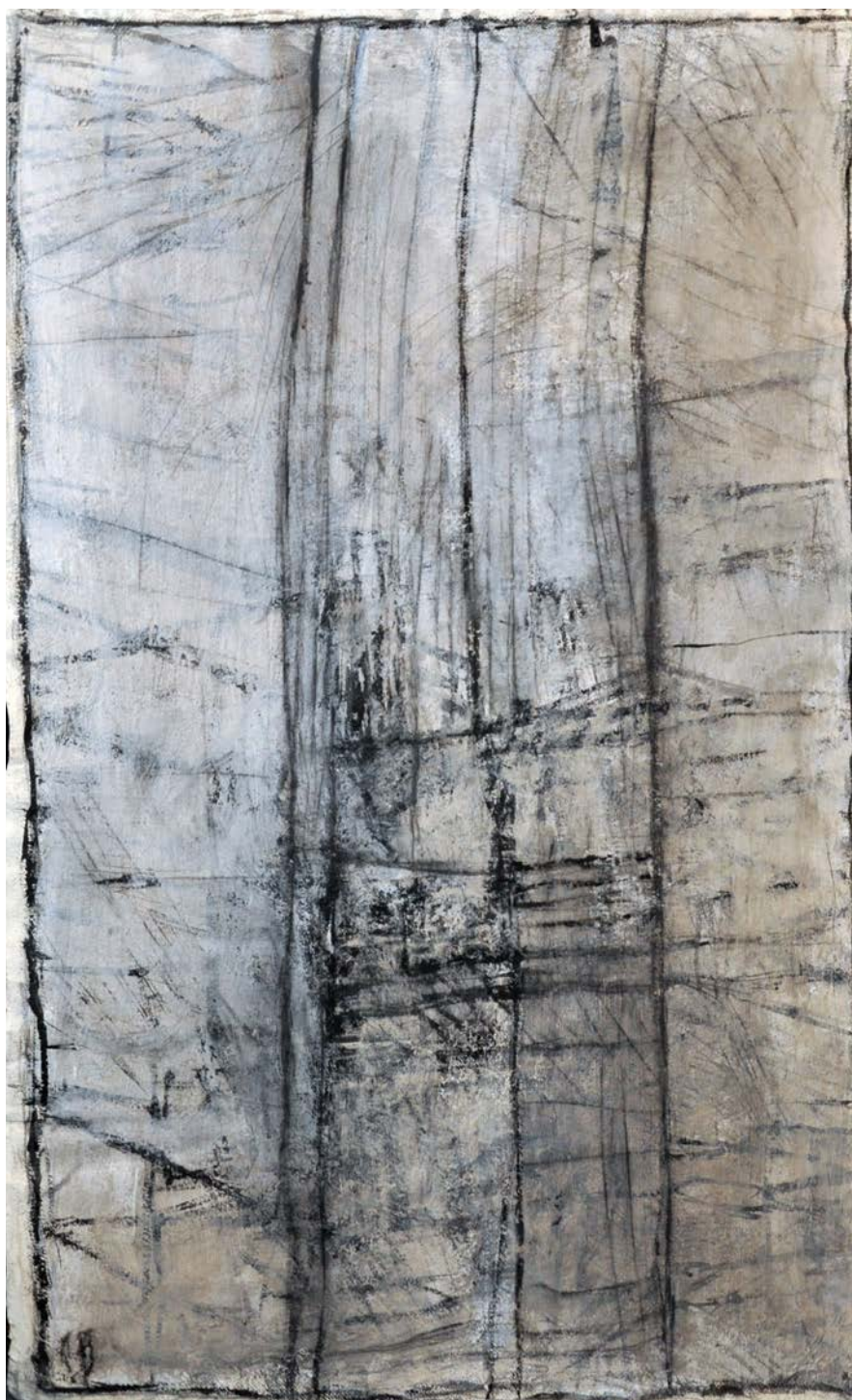
Colette Brunschwig Sans titre, 2010 acrylic on paper mounted on canvas 132 x 93 cm Inv.#CB/P 6