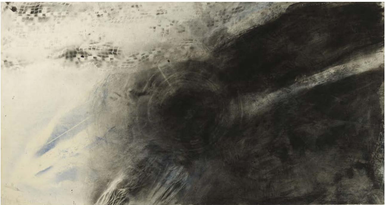
Colette Brunschwig Sans titre, 1981 India ink, blue pigment, paper mounted on canvas 152 x 82 cm Inv.#CB/D 12