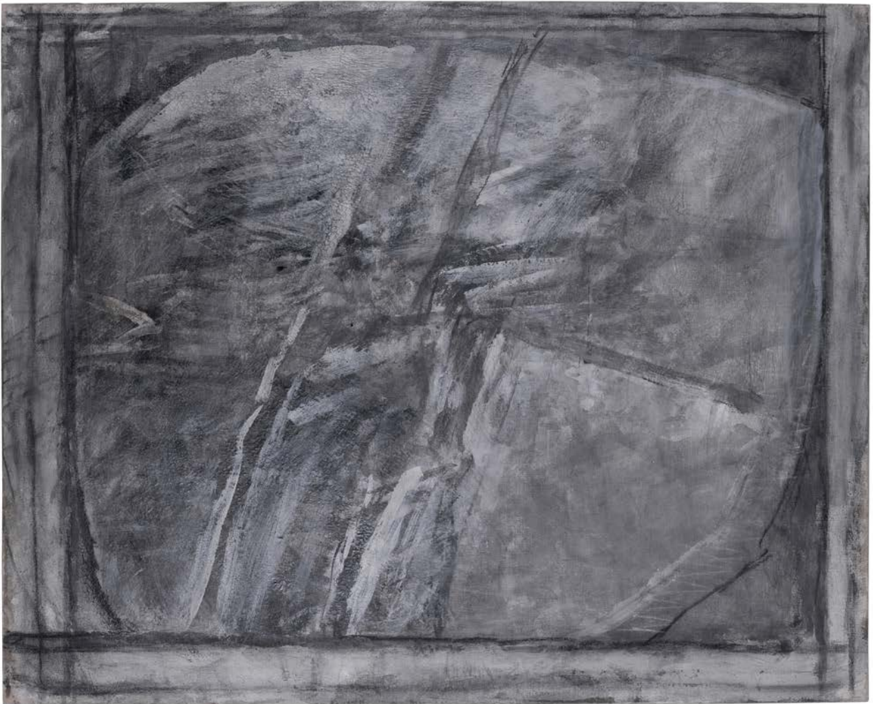
Colette Brunschwig Sans titre, 1970 acrylic on canvas 104 x 84 cm Inv.#CB/P 26