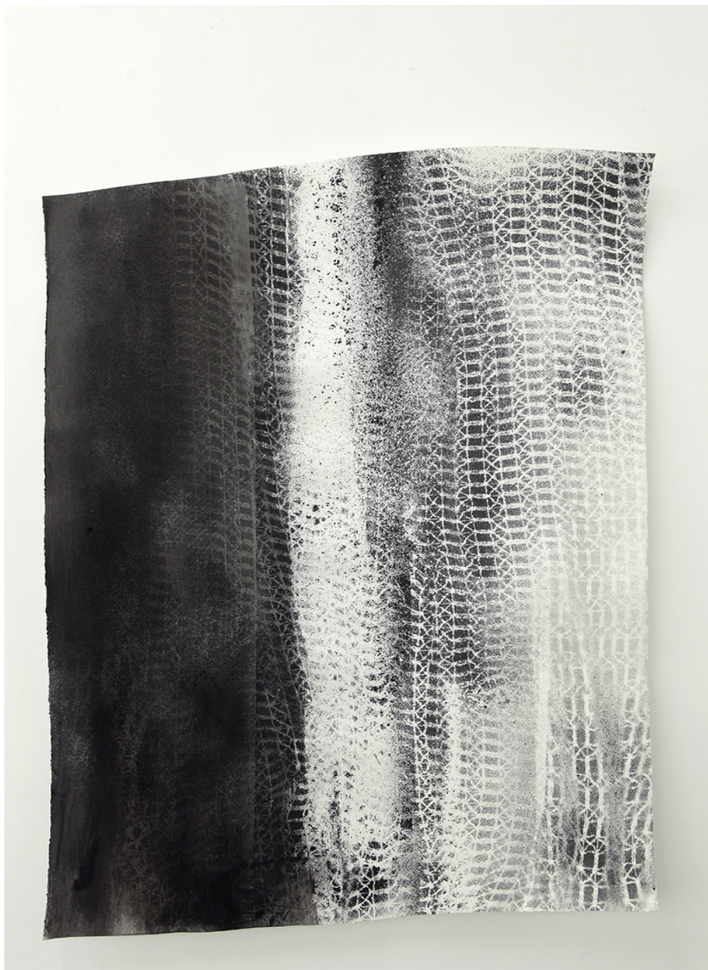
Colette Brunschwig Pochoir 4, 2010 indian ink, pencil on paper 145 x 107 cm Inv.#CB/D 4