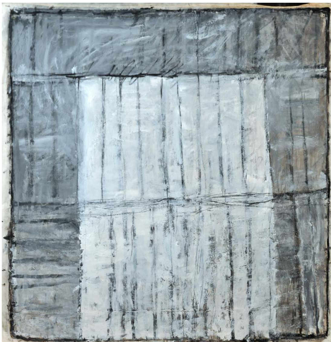
Colette Brunschwig Sans titre, 2010 acrylic on paper mounted on canvas 107 x 117 cm Inv.#CB/P 7