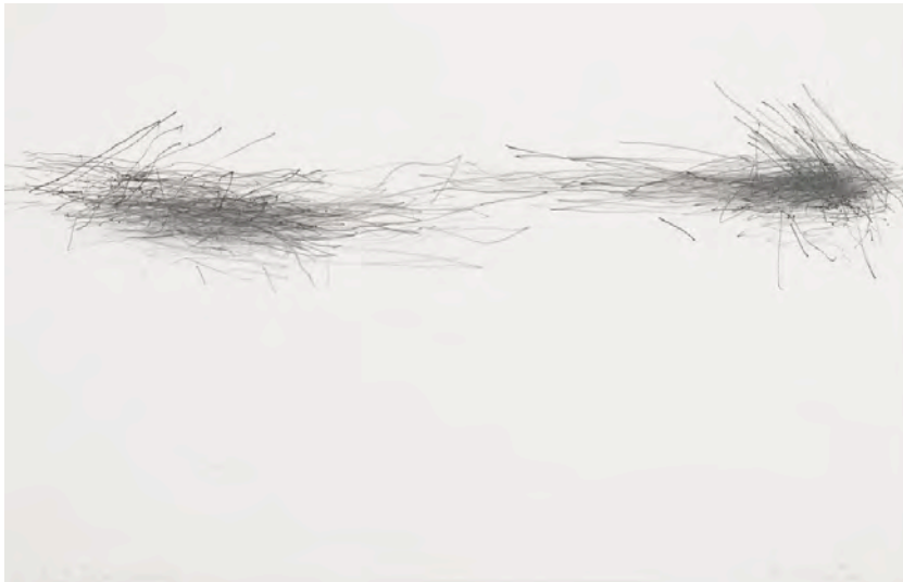
William Anastasi Without Title (Train Drawing, 10.25.12, 16:55, Trenton) 2012 graphite and ball-point pencil on paper 19.3 x 28.6 cm Inv. #WA/D 43