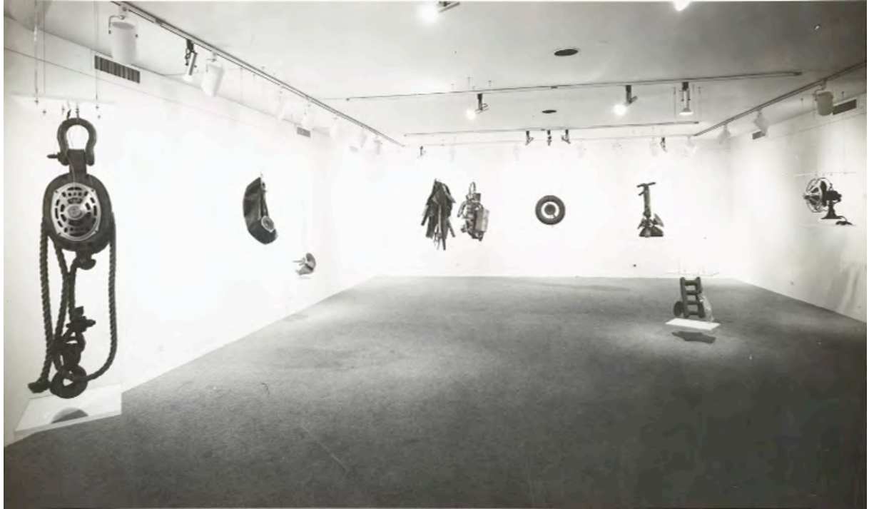
Exhibition view of Sound Objects at Dwan Gallery, New York, 1966