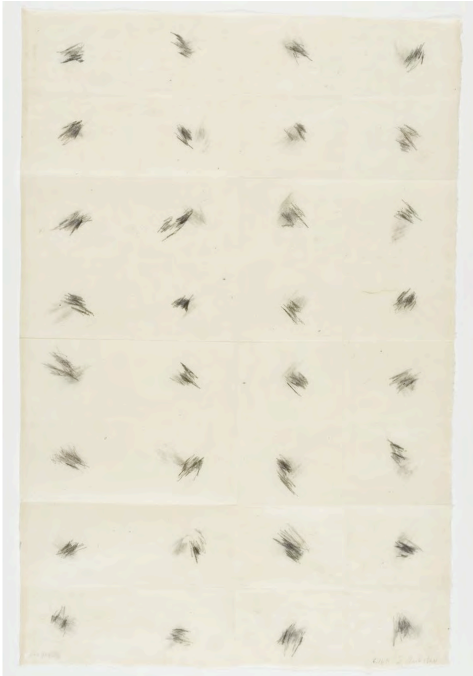
William Anastasi Without Title (Pocket Drawing, 8.11.11)

2011 graphite on Chinese paper 79 x 53 cm