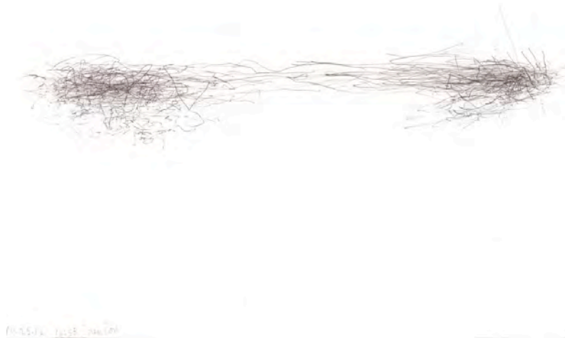
William Anastasi Without Title (Walking Drawing, 9.30.12 St. John's) 2012 pencil on paper 19 x 28.5 cm Inv. #WA/D 227