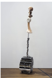
Diego Bianchi Coconut tower 2015 coconuts, epoxy clay, fiberglass, aluminium, electronic devices, cement, varnish 245 x 61 x 44 cm, Inv.# DB/S 14 unique