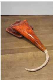
Diego Bianchi Bowed down cone 2015 plastic cone, epoxy clay, varnish 122 x 82 x 18 cm, Inv.# DB/S 12 unique