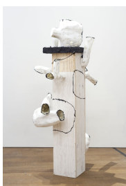
Diego Bianchi DVD Pedestal 2015 wood, dvd player, cut and sanded fiberglass mannequin, cable, tar 198 x 99 x 63 cm, Inv.# DB/S 26 unique