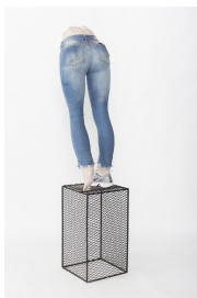
Diego Bianchi Cola celulares 2018 foam rubber, jeans, mobile phones, epoxy putty, iron 177 x 34 x 38 cm, Inv.# DB/S 84 unique