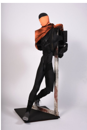
Diego Bianchi Runner 2017 plastic, styrofoam, fabric, wood, paints 183 x 80 x 65 cm, Inv.# DB/S 58 unique