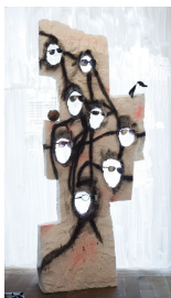
Diego Bianchi Glasses wall 2015 styrofoam, paint, plaster, sunglasses, coconut, wire, plastic 247 x 122 x 41 cm, Inv.# DB/S 10 unique