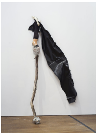
Diego Bianchi Without Title 2015 shoe, tights, plastic, cement, branch, fiberglass, varnish 215 x 25 x 40 cm, Inv.# DB/S 25 unique

A performance session is planned, that will be announced on social media.