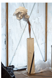
Diego Bianchi Standing leg 2015 wood, sanded fiberglass mannequin, towels, rope, varnish 243 x 31 x 40 cm, Inv.# DB/S 27 unique