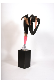
Diego Bianchi pink sock 2017 mannequin, sock, tennis shoes, ping pong ball, paint, wood, acrylic, iron mannequin: 124 x 50 x 72 cm pedestal: 65 x 34 x 28 cm, Inv.# DB/S 57 unique