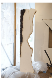
Diego Bianchi Facade face 2015 drywall, natural hair, wood, paint 233 x 66 x 41 cm, Inv.# DB/S 13 unique