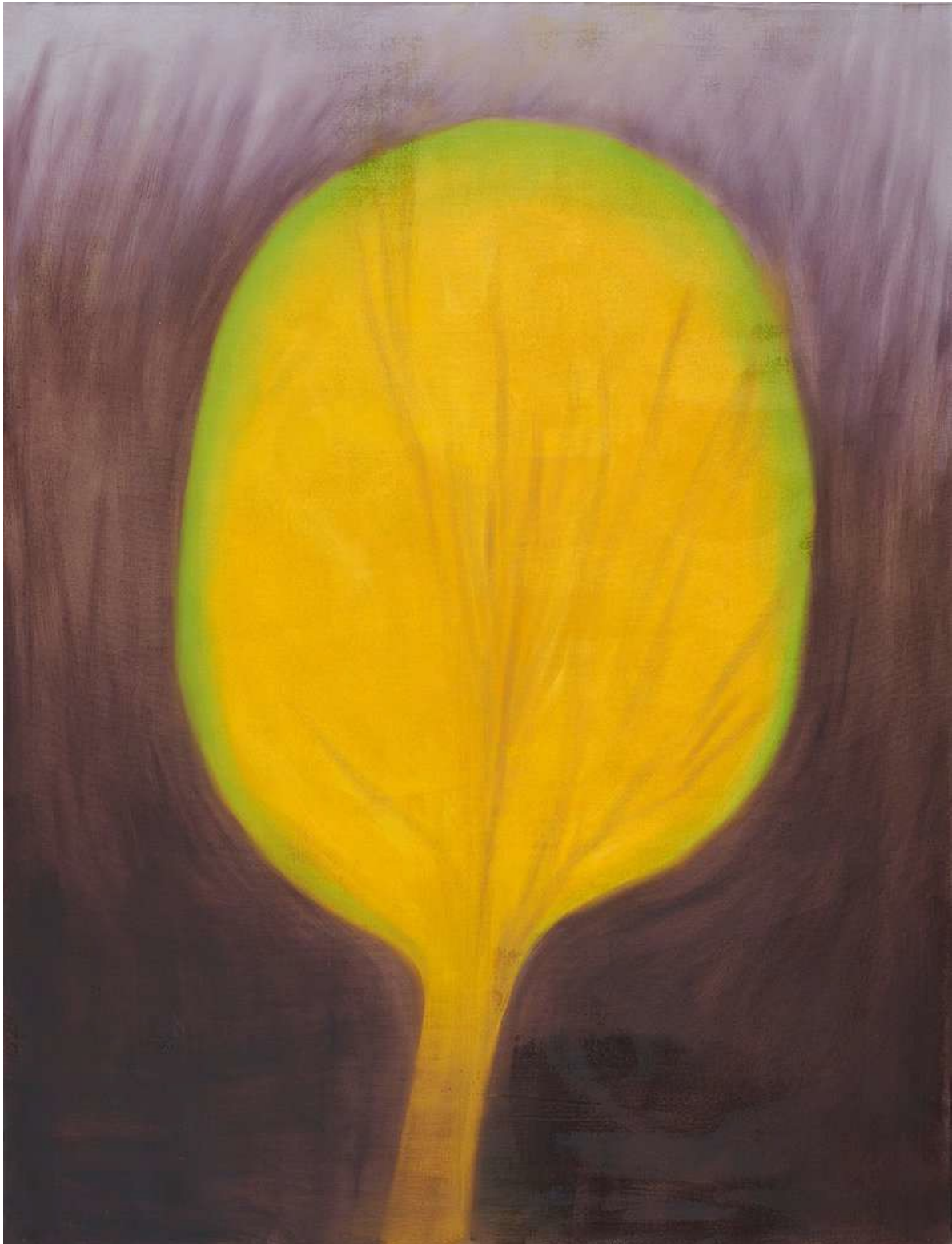
Miriam Cahn vor meinem fenster, 1.11.21 2021 oil on canvas