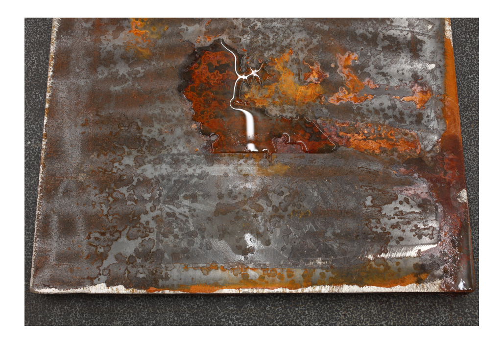
details of "Sink", exhibition views Early Conceptualists, Galerie Jocelyn Wolff, Paris, 2010