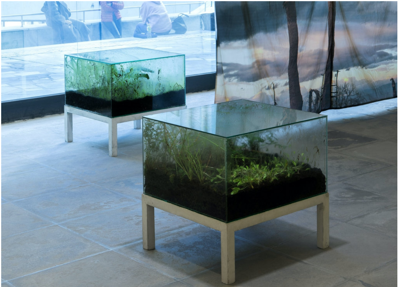
Isa Melsheimer Wardian Case (Fogo Island) , 2018 Inv.# MEL/S 178 concrete, glass, soil, plants 60 x 60 x 60 cm

Please note that availability and price are subject to change.