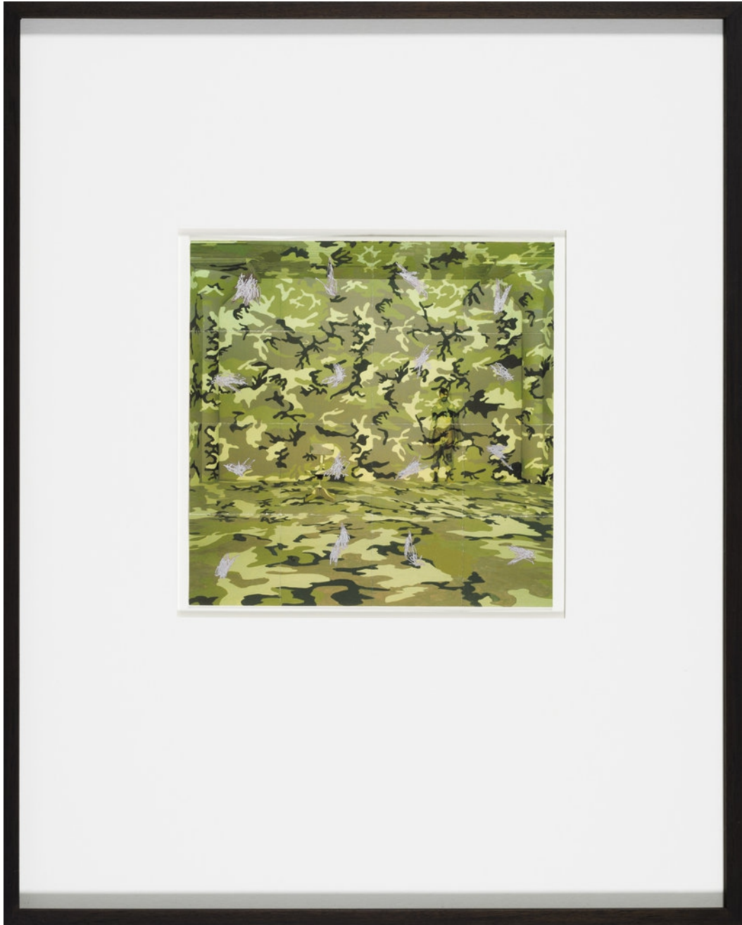
William Anastasi Without Title (Pocket Drawing, camouflage) , 2004 Inv.# WA/D 83 silver marker on inkjet print signed back side 20 x 20 cm

Please note that availability and price are subject to change.