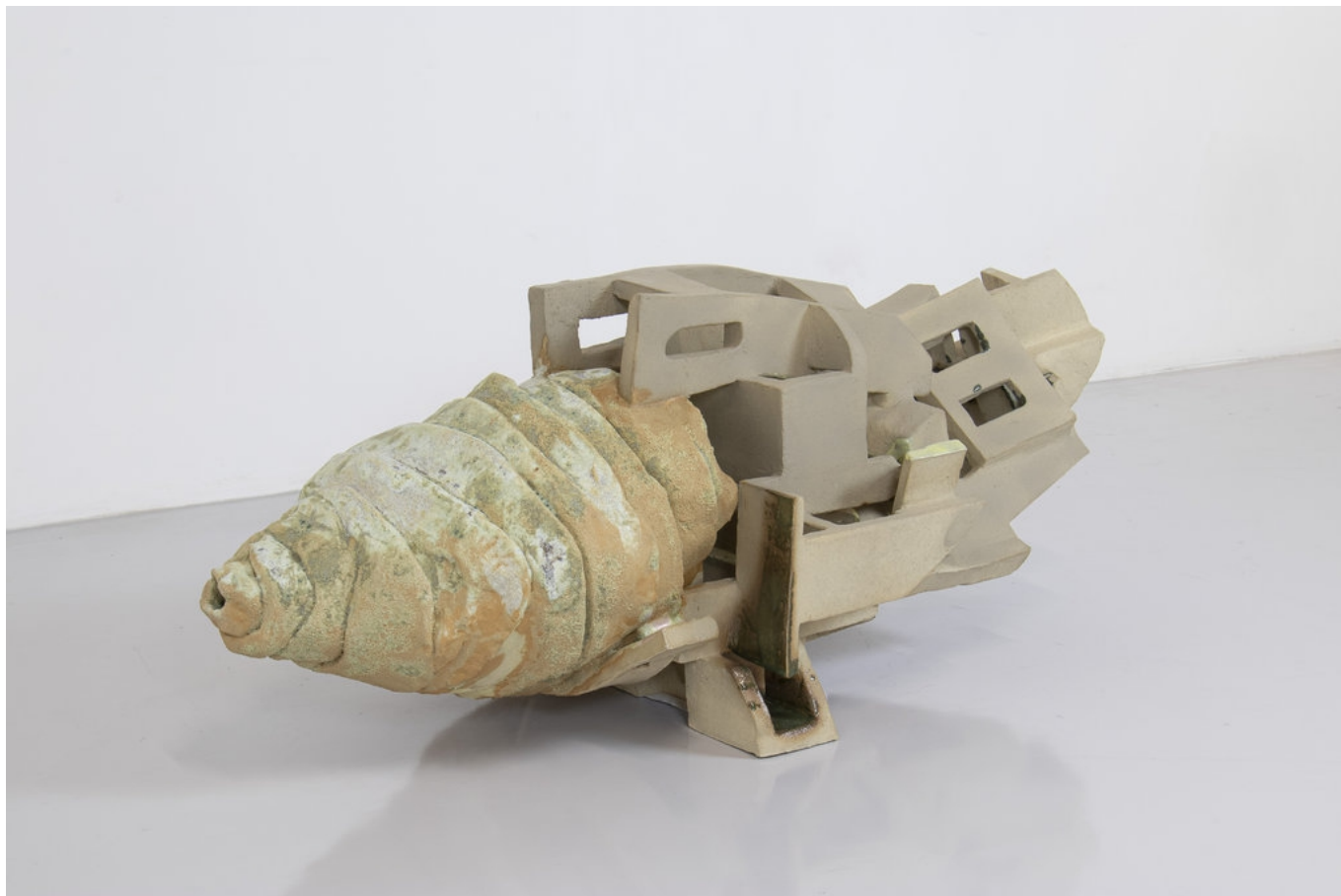
Isa Melsheimer Metamorphosis (Jacques Couëlle) I , 2021 Inv.# MEL/S 150 ceramic, glaze