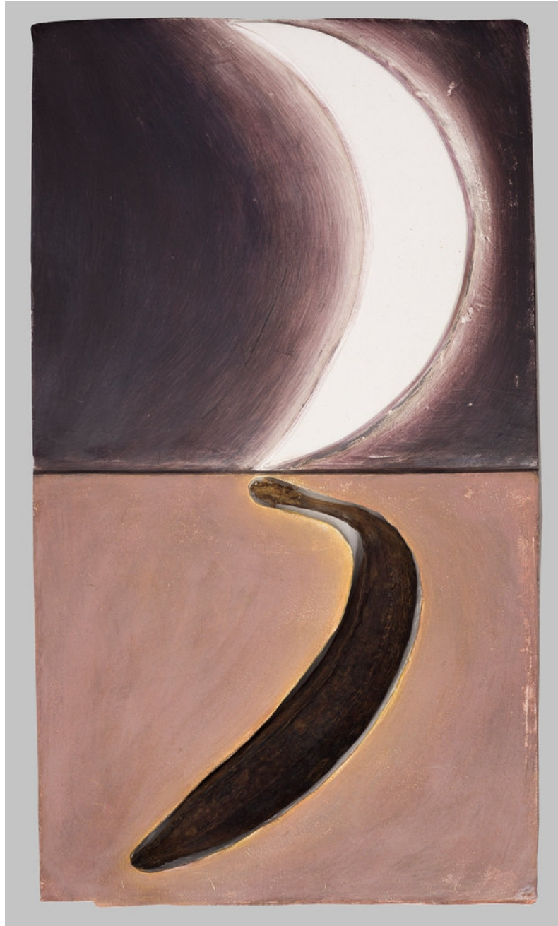
Santiago de Paoli Moon shadow , 2021 Inv.# SDeP/P 229 plantain, pigments and sizing on plaster 44.5 x 25.5 x 3 cm

Please note that availability and price are subject to change.