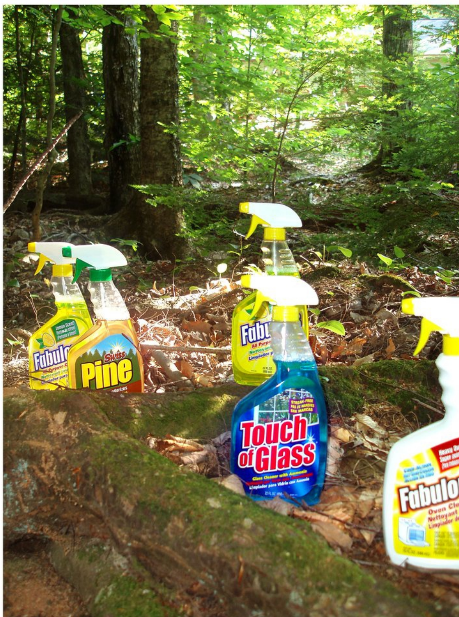
Diego Bianchi Paraiso , 2006 Inv.# DB/PH 3 C-print on Fujifilm professional DPII pearl paper