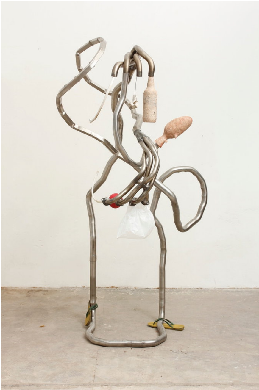
Diego Bianchi Versatility , 2021 Inv.# DB/S 146 stainless steel, epoxy clay, plastic objects, glass, bones and flip flops 220 x 99 x 105 cm unique

Please note that availability and price are subject to change.