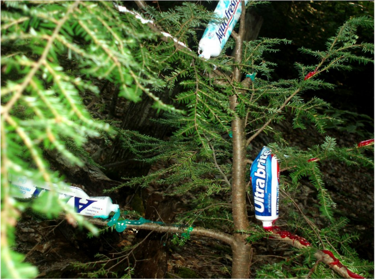
Diego Bianchi Paraiso , 2006 Inv.# DB/PH 1 C-print on Fujifilm professional DPII pearl paper