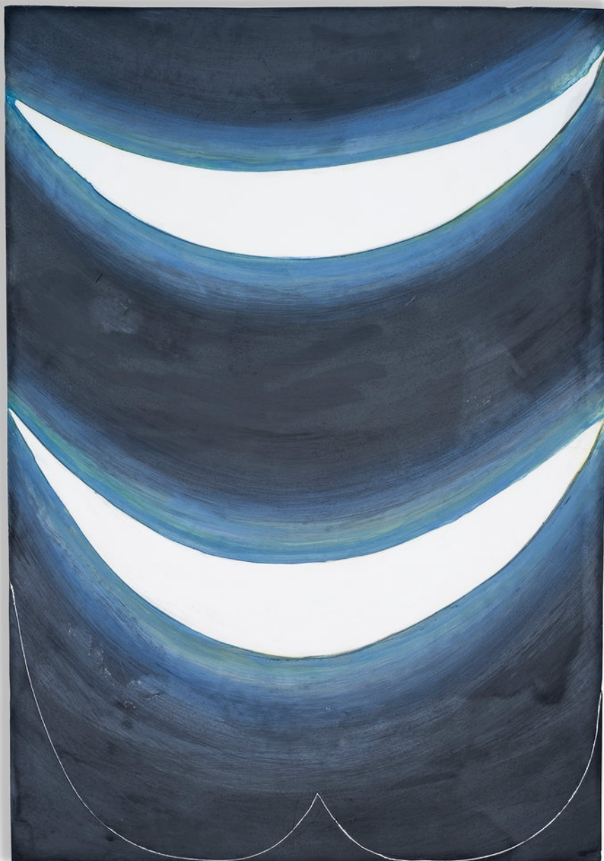
Santiago de Paoli Tiempo libre , 2018 Inv.# SDeP/P 102 plaster, milk, pigment 50.5 x 35.5 x 3.5 cm

Please note that availability and price are subject to change.