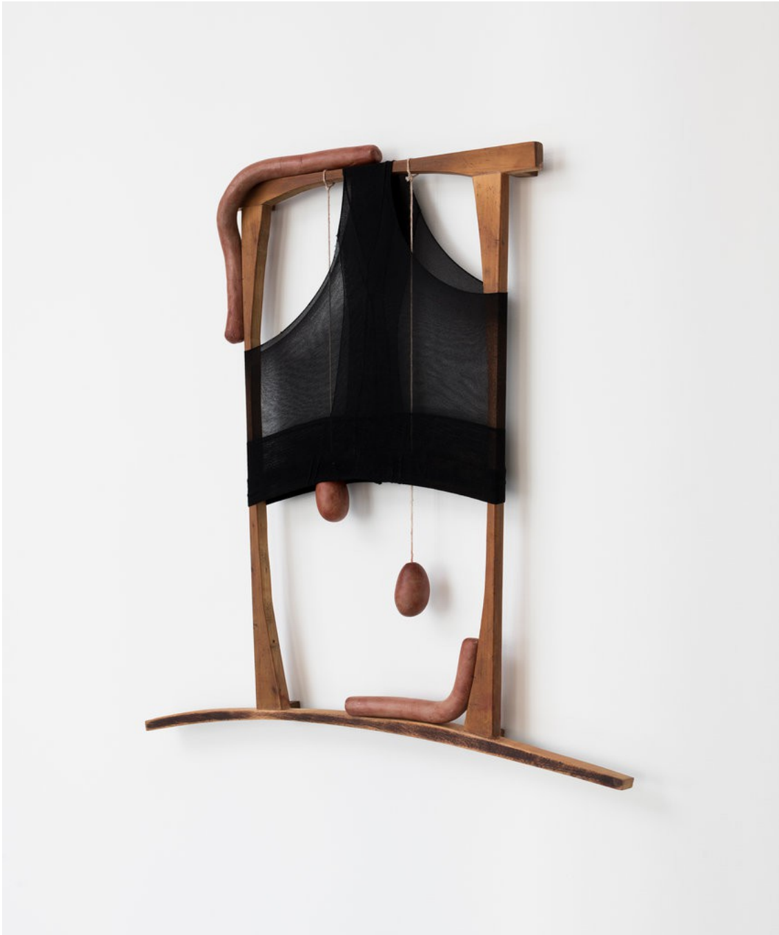
Diego Bianchi Framing Time 5 , 2013 epoxy clay, wood, stocking, threads