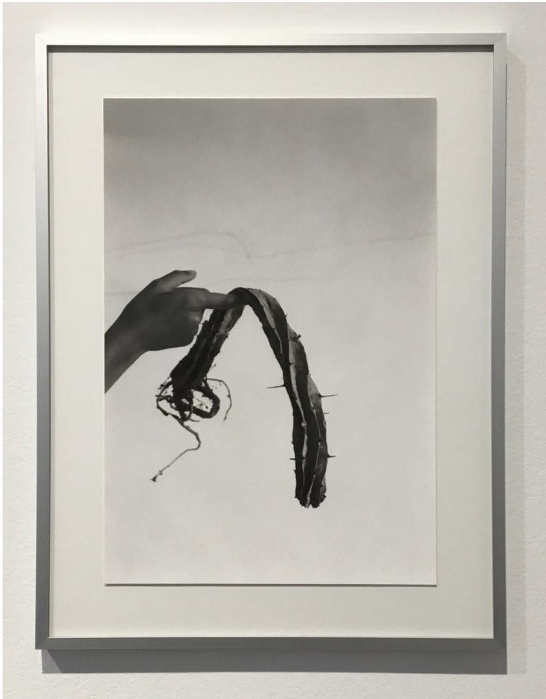
Katinka Bock Dead Cactus , 2016 gelatin silver print on paper signed, titled and dated back side at the bottom, right 45 x 30 cm ed. 3/4 + 2 A.P.