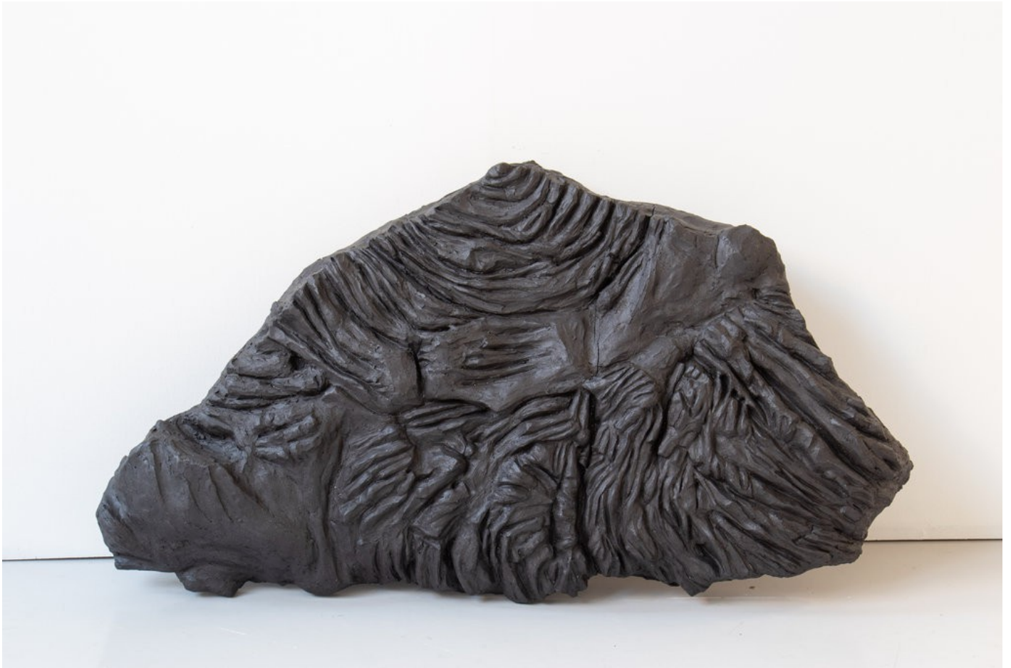
Irene Kopelman Levy's Relief - Location B , 2009 ceramic