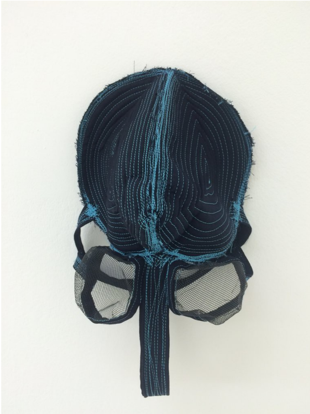
Isa Melsheimer Trekking Mask V , 2015 fabric, wire, thread