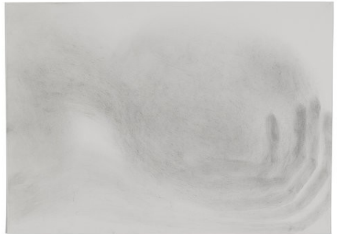
Miriam Cahn im traum den nackten säugling halten , 30.10.92 pencil on paper