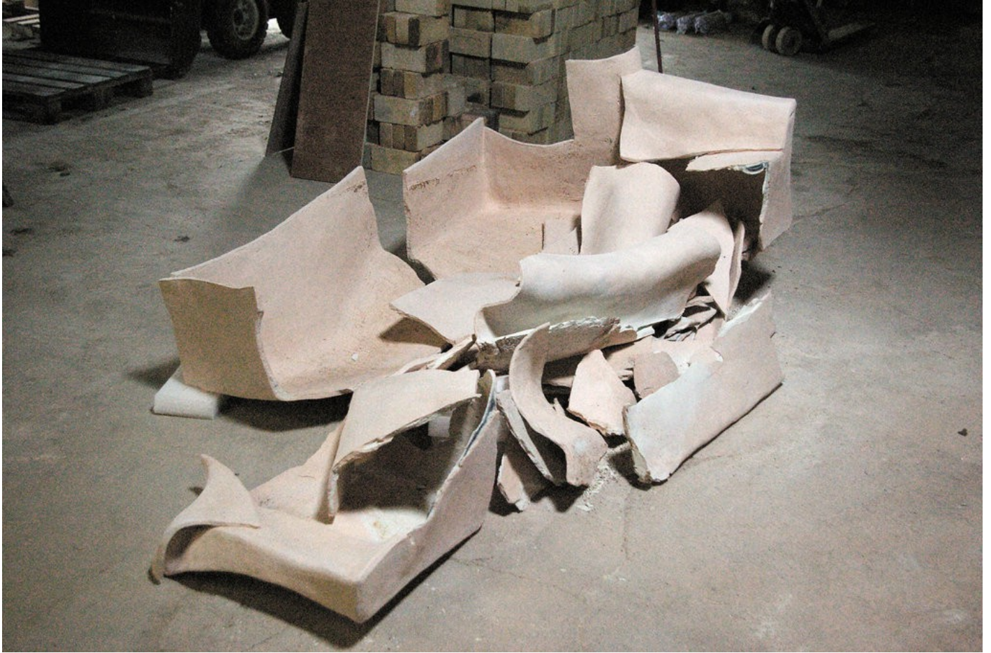
Katinka Bock Pliage solitaire (ruine) , 2008 photograph