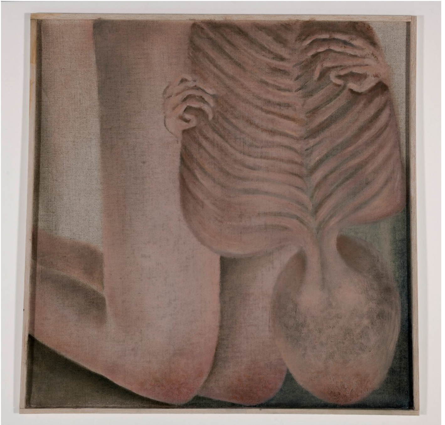
Santiago de Paoli Solo , 2020 oil on linen fabric