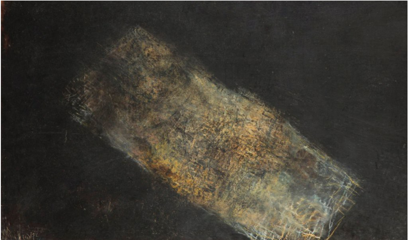
Colette Brunschwig Composition , 1973 acrylic and mixed media on wood signed and dated front side at the bottom, left 54 x 88 cm