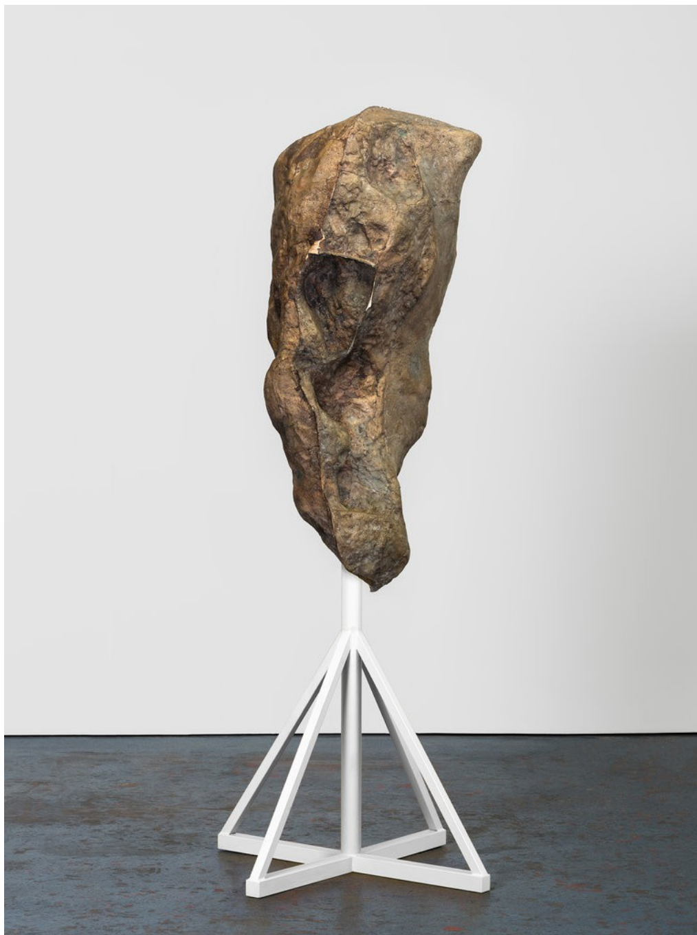
Francisco Tropa OCO creux à l'intérieur d'une statue, 2016 bronze, painted steel tripod