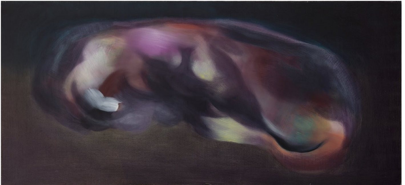
Miriam Cahn herumliegen, 8+13.07.2009 , 2009 oil on canvas