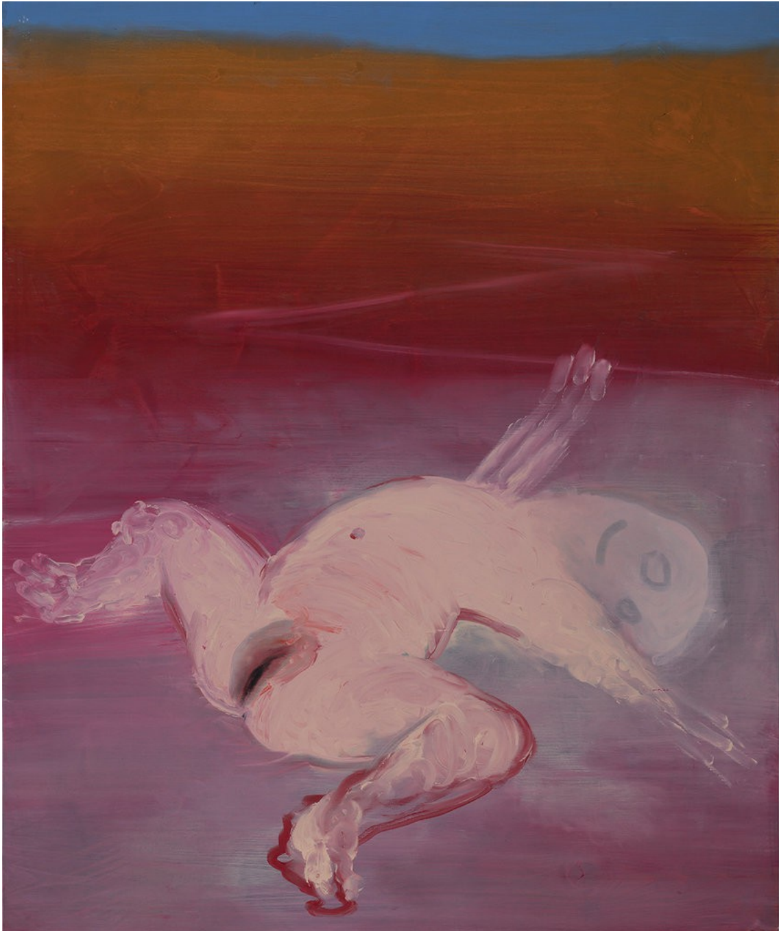
Miriam Cahn o.t., 8.9.19 , 2019 oil on wood