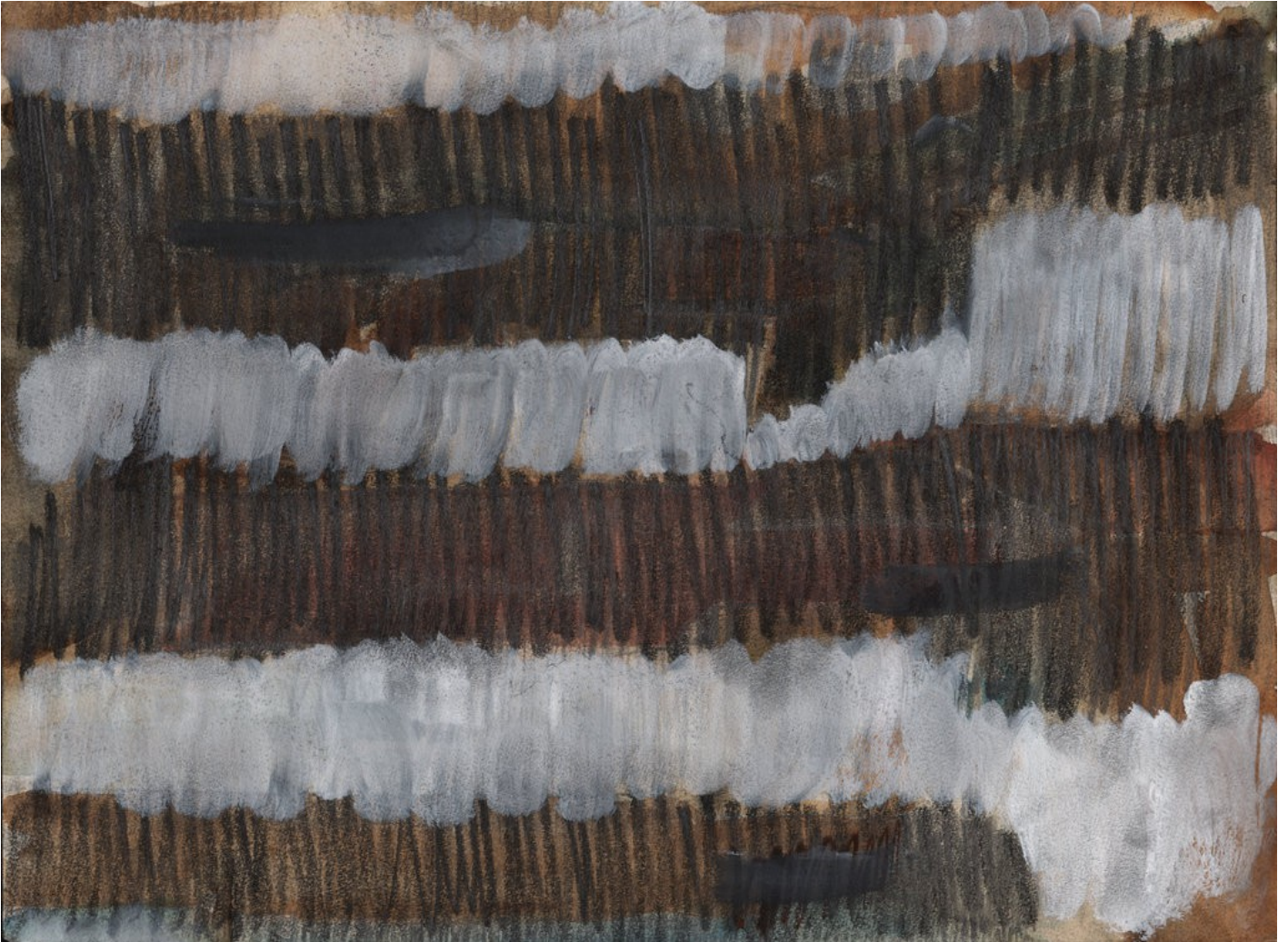
Franz Erhard Walther Schraffurzeichnung , 1959 graphite, gouache, watercolour on paper