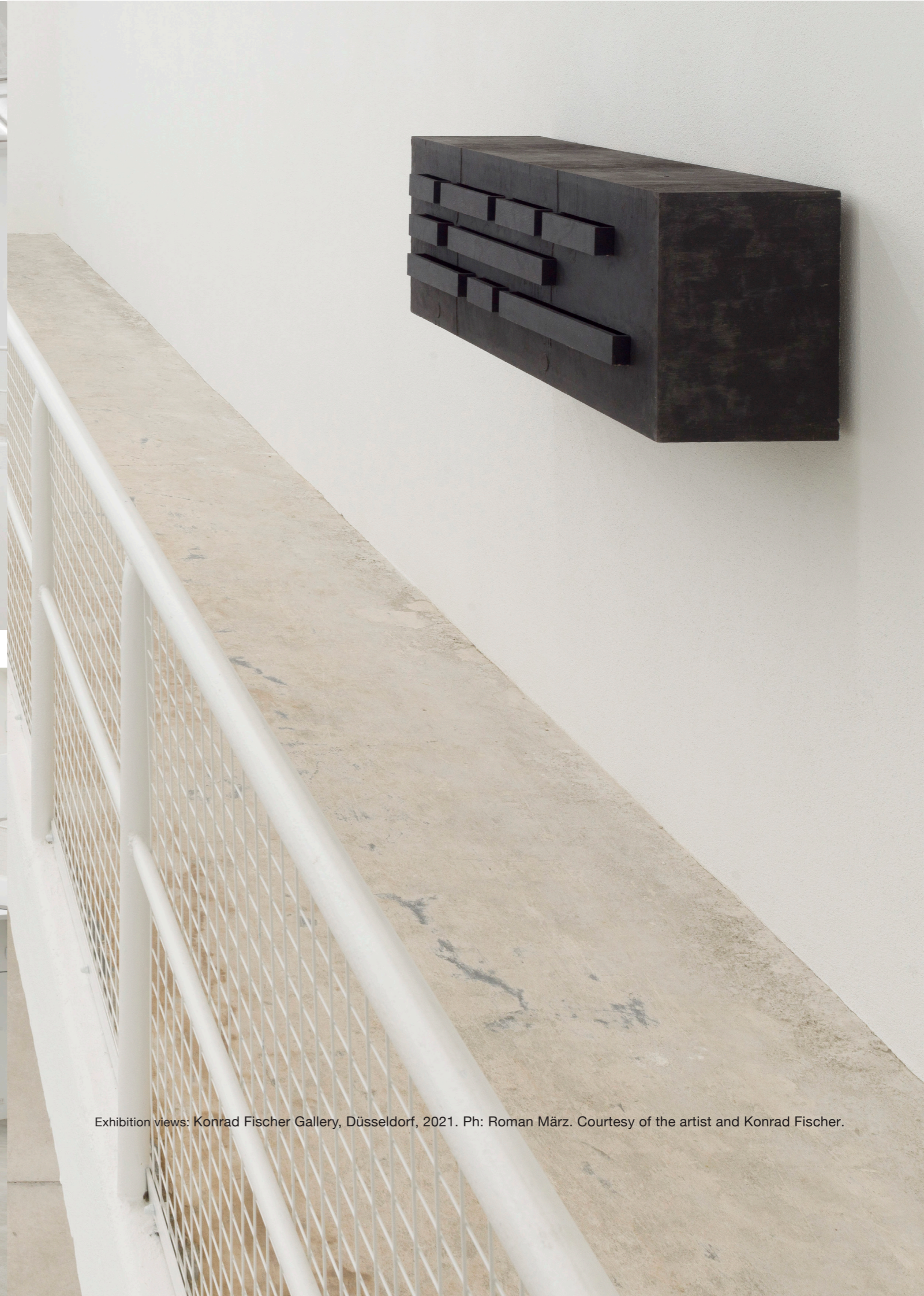
Exhibition views: Konrad Fischer Gallery, Düsseldorf, 2021.