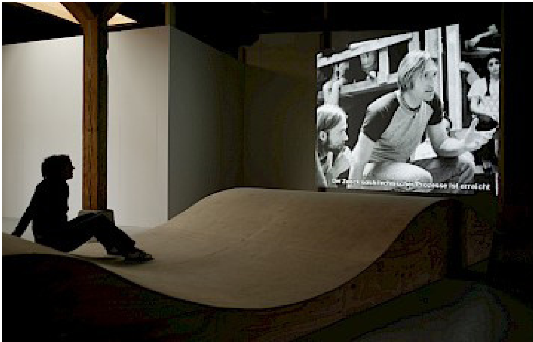
Exhibition view: Capitulation Project at Kunstraum Walcheturm, Zurich, Switzerland, 2003