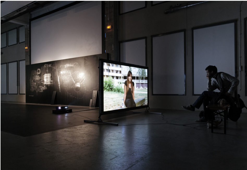
Exhibition views: Episode1: Devoir et dérouté. Ce dont on sera dans l'avenir capable. Centre d'art et de recherche, Béton salon, Paris, France, 2011

We mix sequences from everyday life, archives from the Candillis architectural project, interviews with teenagers from the neighborhood and a narrative.