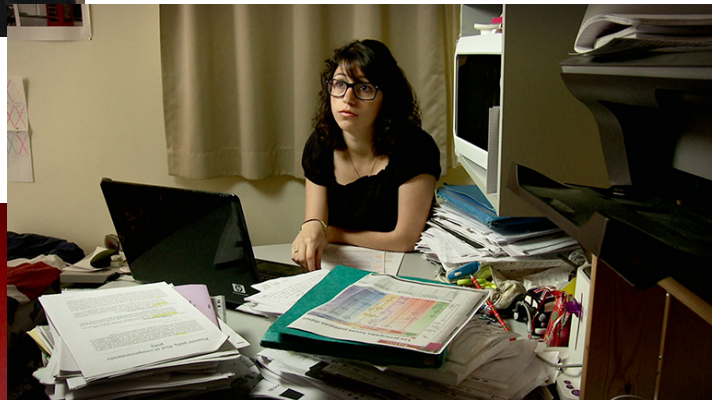
Film stills épisode 3: Ainsi Arrivèrent-ils fébriles au seuil de la voie royale. 2013