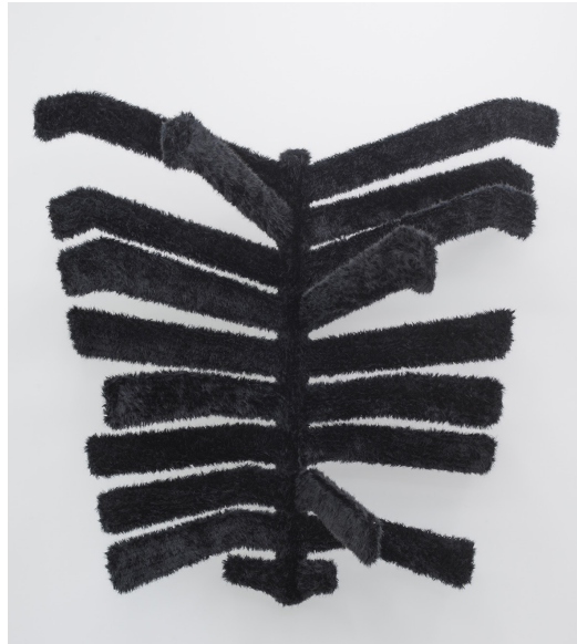
Exhibition details The social elevator turned to a weather vane then confined Galerie Jocelyn Wolff, Paris, 2016