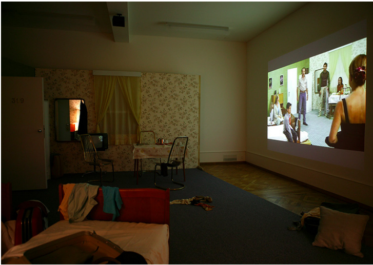
Exhibition view and set up installation view: Pasquart Kunsthaus, Biel, Switzerland, 2004

Set and video projection, digital video, color, german language with english subtitles, 5:17 min