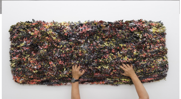
Exhibition views: (top) Martha, bittel (right) See by your palm how everything appears (bottom) Ambushed by the fourth wall

Galerie Jocelyn Wolff, Paris, France, 2016