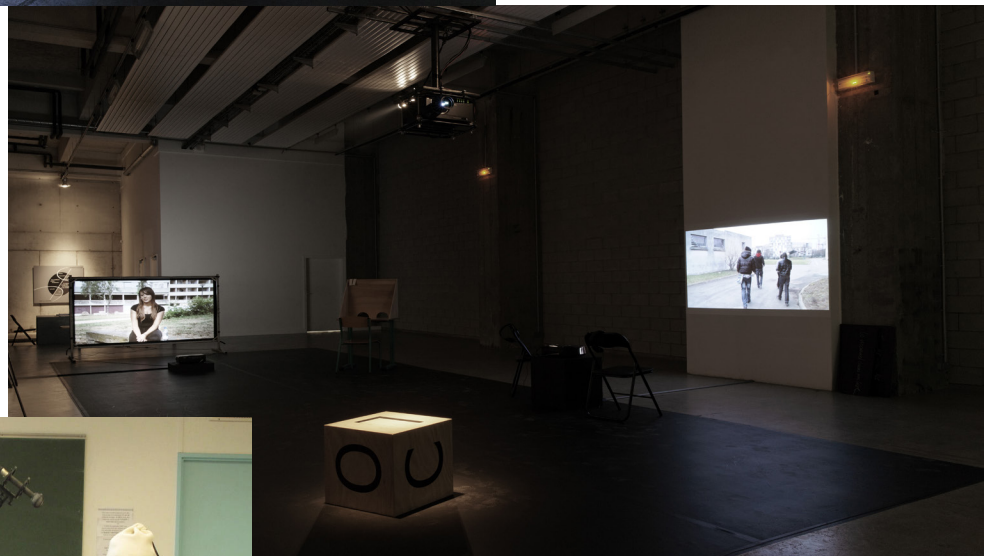
ON SET Film Still: Episode 2: Ce trait c'est ton parcours