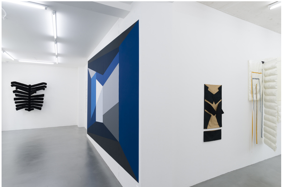
Exhibition view: Orthographic projection, Galerie Jocelyn Wolff, Paris, 2016