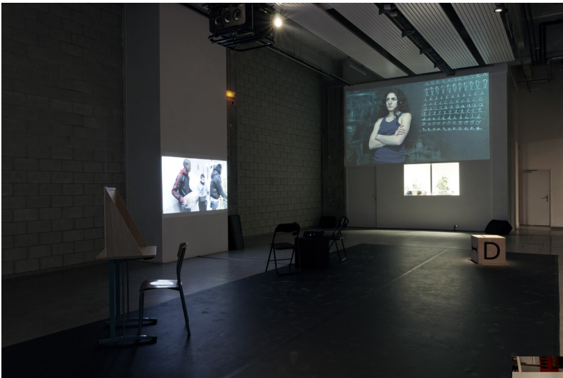
Exhibition view: Ce dont on sera dans l'avenir capable Béon salon, centre d'art et de recherche, Paris, France, 2011

Since 2009, Frédéric Moser and Philippe Schwinger have embarked upon yet another "De/Tour de France", again in the format of a TV documentary. They follow Jacques Rancière's hypothesis that the real has to be fictionalized in order to be thought. The youth they portray does not at all confirm the clichés that media and politics create. In fact, this reality is much more difficult. Capturing its complexity in their films, Moser and Schwinger "re-think" the notion of "France": as a narrative and a discourse that reestablishes a space for an adolescent's emancipation. By employing the means of fiction, Moser and Schwinger expose the forces that try to reduce the complexity and openness of social reality, that want to bring regulation and regimentation." -Alexander Koch