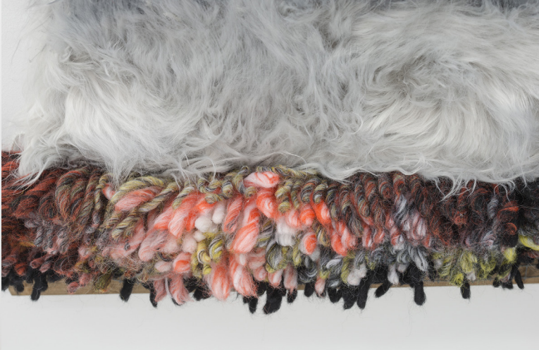
Exhibition view and detail: Modernist surrogate softness

Galerie Jocelyn Wolff, Paris, France, 2016