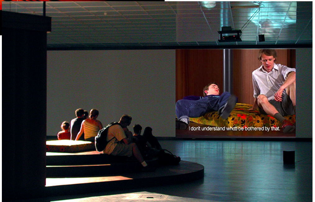
Exhibition view: Internment area kunstverein stuttgart, Germany, 2002