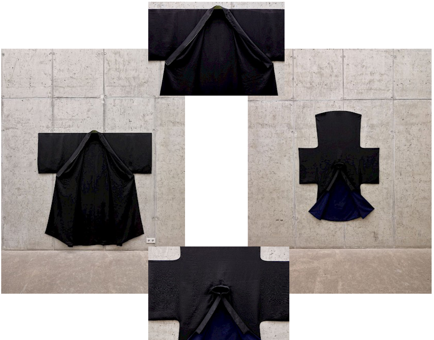
Exhibition views and details Citizen O and Citizen K, KOW, Berlin, Germany, 2018