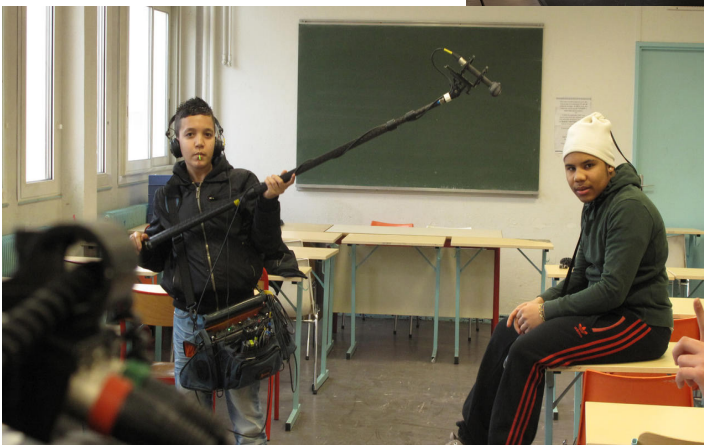
Galerie Jocelyn Wolff