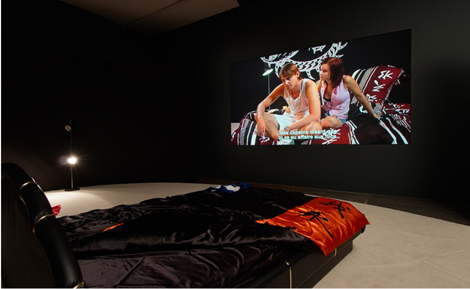
Exhibition view: Schwejk Perspektiven, Installation Avant moi le flou, après moi le déluge, MAMCO, Genève, 2008

The project was developed together with acting students from the University of Performing Arts in Graz from documents, written dialogues and performative sequences. In a kind of laboratory situation, the Kunst Haus Graz became first the filming location and then the cinema for a new film version of Schwejk.