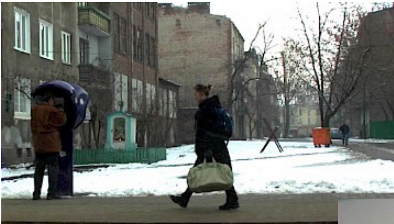
Film Stills: Revival Paradise, 2005