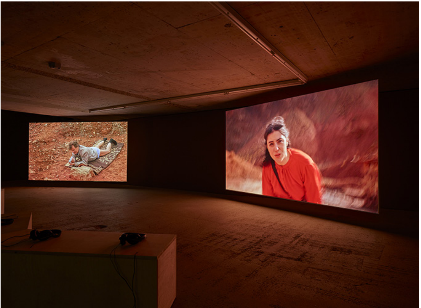
Exhibition view: Double bodies , 2018