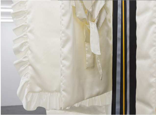
Exhibition view and details: (top) From then on, we didn't walk alone at night any- more (I), (II) (left) Whispering at my door

Galerie Jocelyn Wolff, Paris, France, 2016