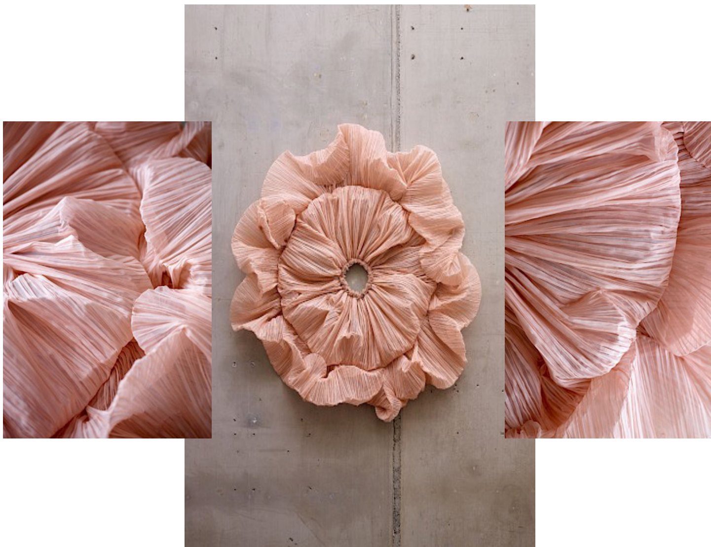
Exhibition views and details Only words make the decrees KOW, Berlin, Germany, 2018