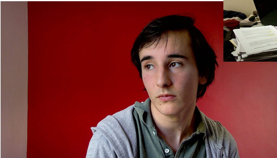
Galerie Jocelyn Wolff