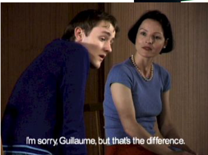
film still and setting up photos Internment area 2002