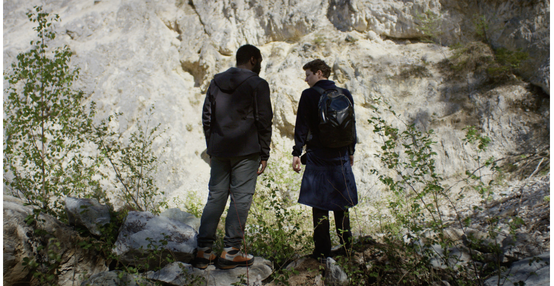
Film stills: A Topsy-Turvy Rising, 2018

A Topsy-Turvy Rising deals with two disciples who recently lost their leader. It is inspired by Hölderlin's fragmented play about the death of Empedocles, in which the hero, the philosopher from Agrigento, refuses the royal crown and casts himself into Etna for the sake of democracy and revolution – death as the necessity for a rebirth of society. The work focuses on those remaining individuals who are now solely responsible for realizing the plans of their leader. With the vision of an egalitarian community, they endeavor together to remember his last words.