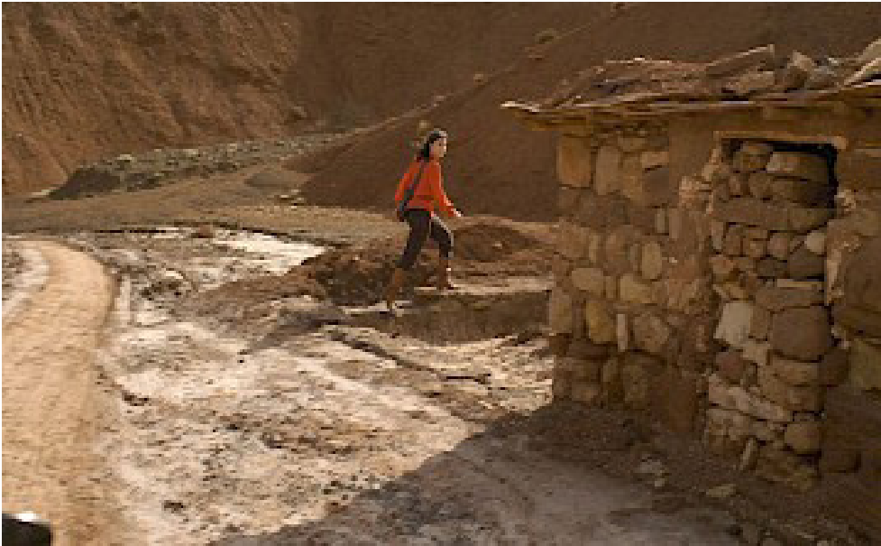
Film stills: Double bodies, 2018