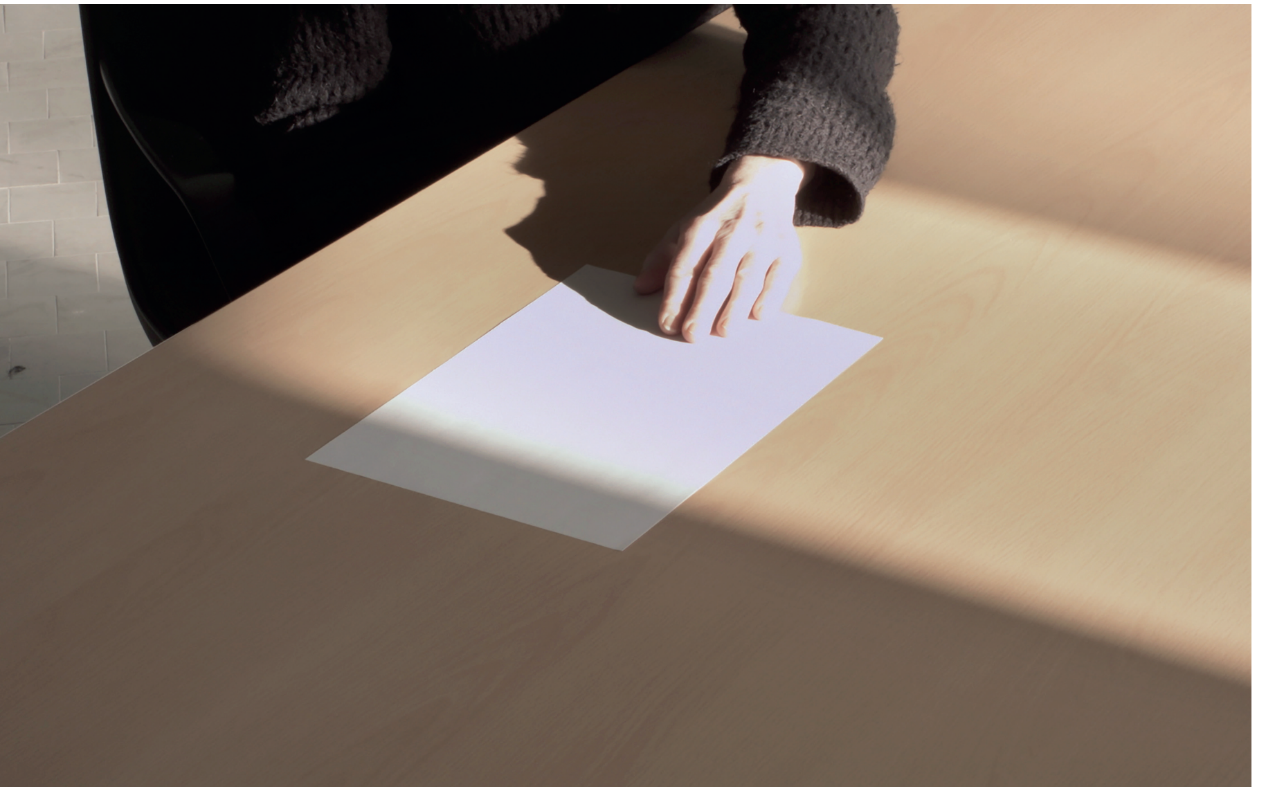
Top - Marie Cool Fabio Balducci, Untitled, golden leafs, golden stars, sunlight, desktop, 2011. Courtesy: the artists and Marcelle Alix, Paris Bottom - Marie Cool Fabio Balducci, Untitled, sheet of paper (A4), sunlight, desktop, 2007. Courtesy: the artists and Marcelle Alix, Paris