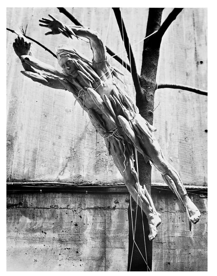
Paul Thek, The Fishman, installation view of the courtyard at Stable Gallery in New York, 1969.

One immediately has the impression that a certain mannerism, a certain solemnity is a work: to prefer is rarely used in this way and neither Bartleby's employer, the lawyer, nor the other 'writers' generally use it ('queer word, I never use it myself...') More commonly, one would say 'I would rather not.' But more than anything, the strangeness of this phrase goes beyond speech itself. True, it is grammatically and syntactically correct but its abrupt conclusion, NOT TO, which leaves what repels suspended in mid-air, gives it a radical aspect, a sort of liminal function. The repeated, insistent use of it makes it all the more perfect and unusual. Whispered by a soft, patient, expressionless voice, it becomes a type of insubordination, forming an inarticulate whole, a single breath. In this sense, it has the same power, the same function as an agrammatical phrase.<sup>6</sup>