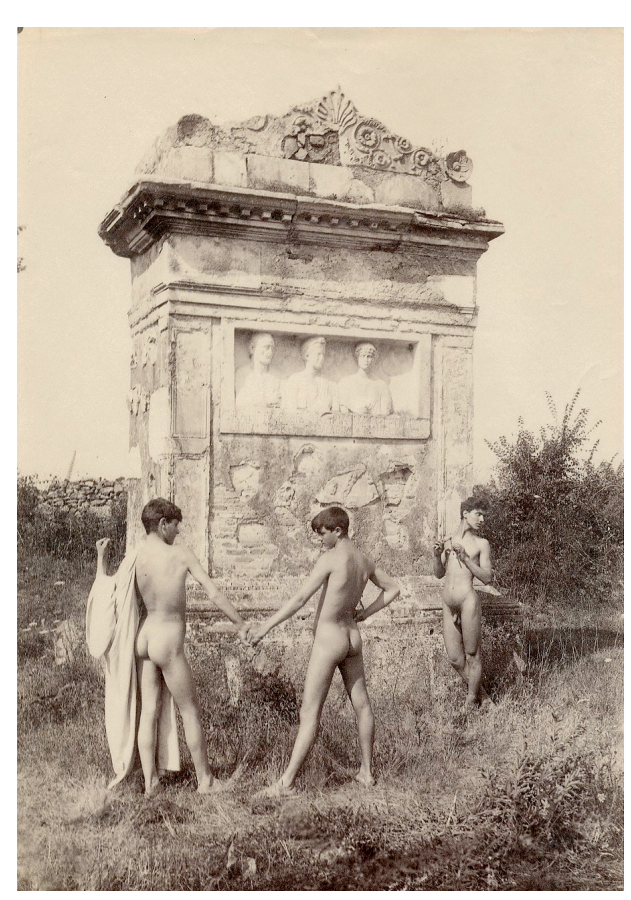
Wilhelm von Plüschow, Two nude youth in front of the Ancient Roman tomb of the Rabirii, along via Appia, Rome, ca. 1900.

The performances in Athens and in Kassel have different titles: My Sweet Country and Speaking of Pictures. The performances revolve around (with slight differences) many similar sources. We want to explore different approaches. We see the postures as a visual language that can be composed and reorganized according to the needs we encounter