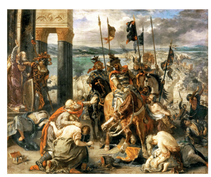
Eugène Delacroix, The Entry of the Crusaders into Constantinople, 1840.

PG (W) Working in Athens on an archaeological site and in the Panathenaic Stadium (Kallimarmaro), we saw that the ancient ruins and the stadium appear inevitably as symbols of the identity of a country. In the Kallimarmaro we embodied images from Nelly, Wilhelm von Plüschow, and ancient Greek sculptures on the outer edge of the stadium with an asymmetrical perspective on the whole from an elevated viewpoint. Our performative activity for the video camera happened next to the joggers and the school kids doing sports down in the stadium. Our pursued continuity with the ancient past was evident when we were in direct bodily contact with a monument. Especially seeing the kids, who were brought there in order to experience this historical stadium (which is a nineteenth-century classicist reconstruction of an ancient structure), to cultivate their national identity.