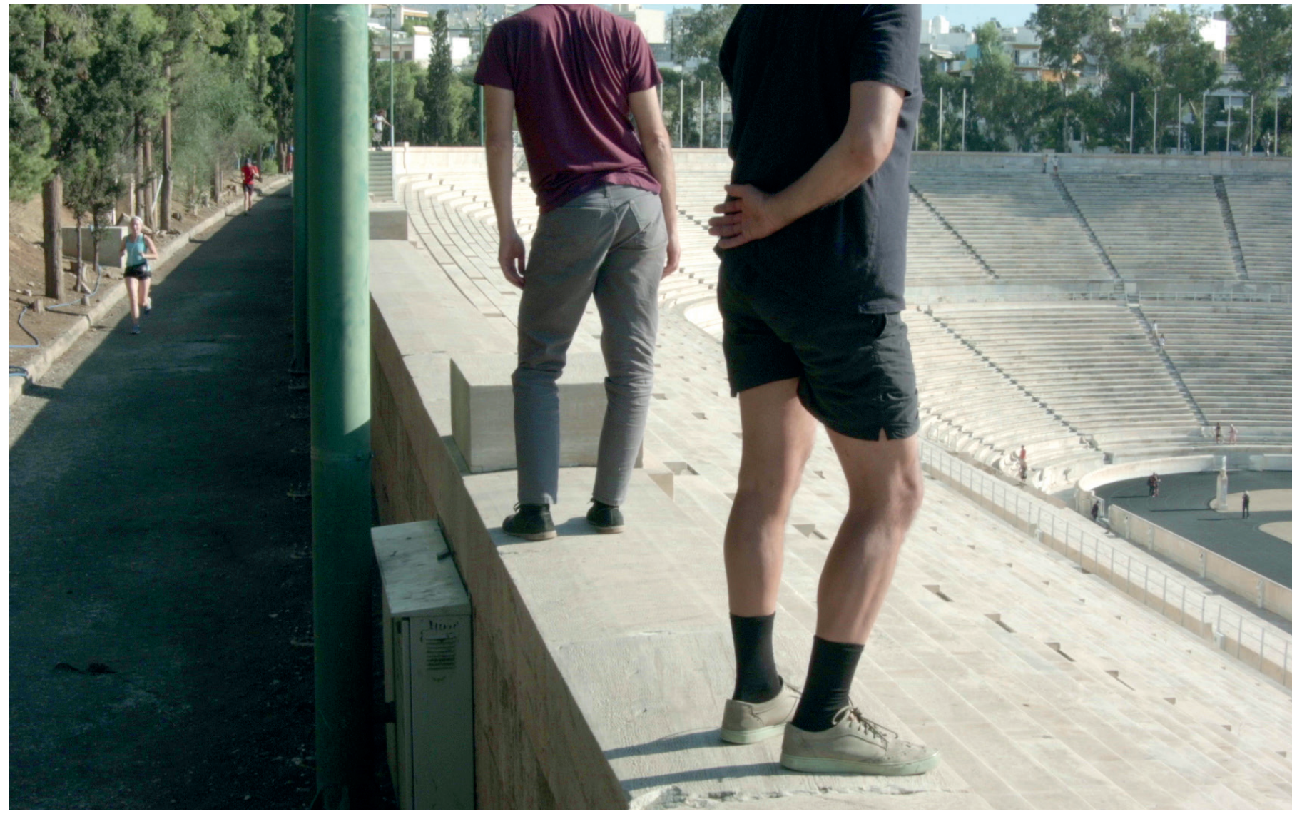
Top - Prinz Gholam, My Sweet Country (still), 2017. Courtesy: the artists and Galerie Jocelyn Wolff, Paris Bottom - Prinz Gholam, Speaking of Pictures (still), 2017. Courtesy: the artists and Galerie Jocelyn Wolff, Paris